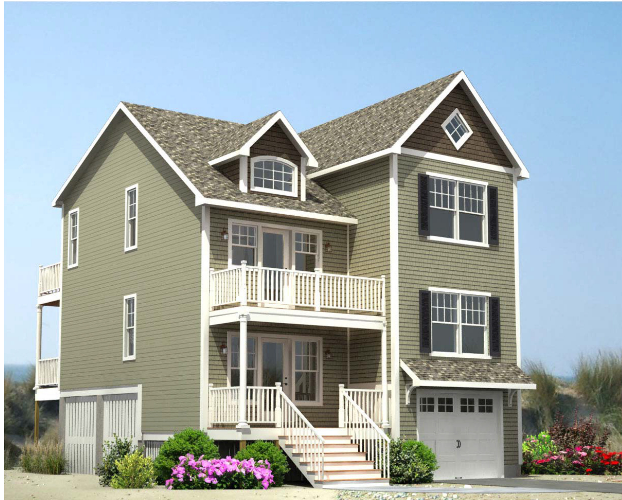
Photo shown with optional features not included in base price.