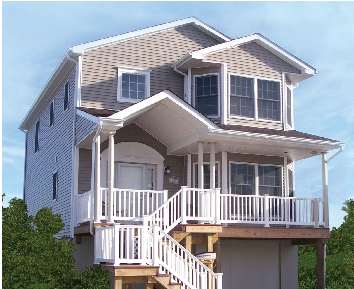
Photo shown with optional features not included in base price.