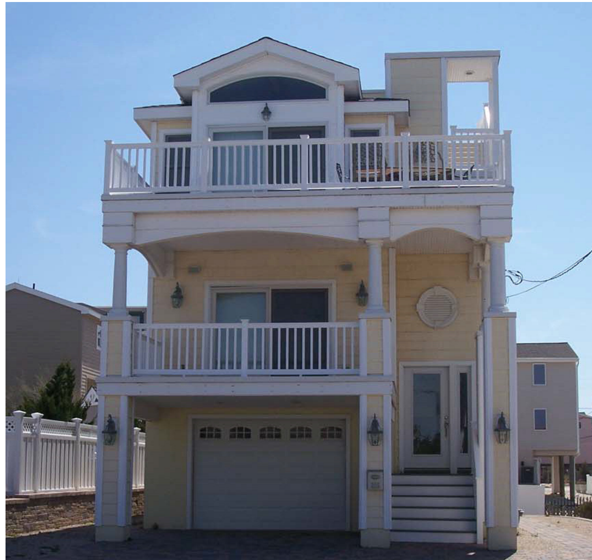
Photo shown with optional features not included in base price.