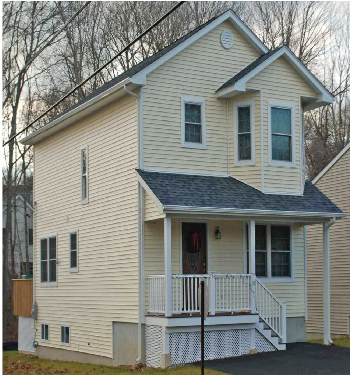
Photo shown with optional features not included in base price.